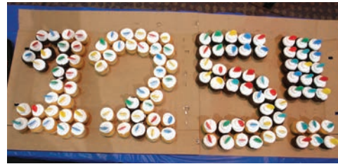
CUPCAKES ON DISPLAY DURING THE COLLEGE COMMUNITY MEETING HELD JAN. 17.

Thank you for taking part in our celebration. Above all, thank you for Caring.